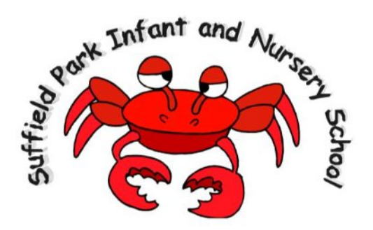
A safe and happy place inspiring curiosity, respect and confidence